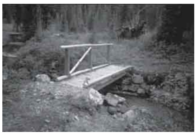
Figure 62--A simple footbridge with a handrail.

On national forests, all bridges require design approval from engineering before being constructed. Some regions have standardized, approved designs for simple bridges.